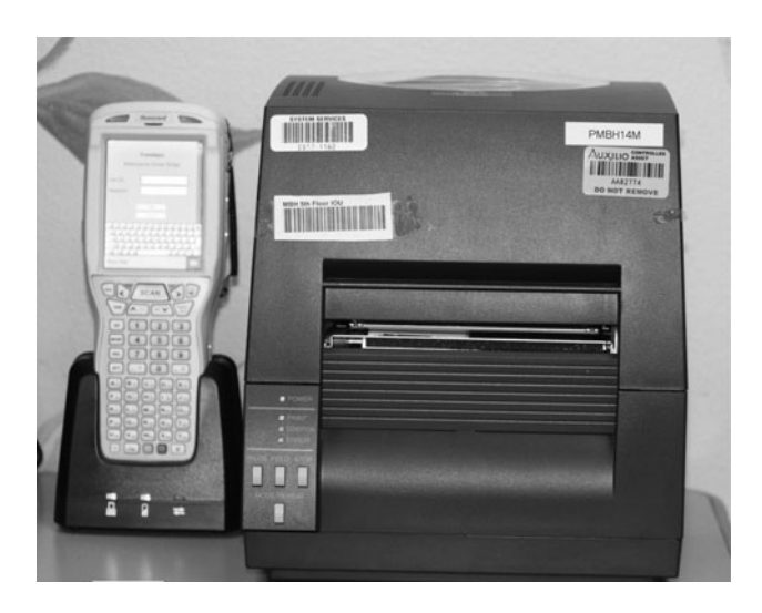
Figure 1. Breast milk scanner and label printer.

Costs to implement a breast milk bar coding system include the cost to purchase software, scanners, and other hardware, as well as expenses for staff training time. Software and hardware costs vary by vendor and size of the facility. Hardware may include additional bedside computers, handheld scanners, and label printers. Training time includes not only the time for staff training but also training for superusers to learn the system and to support the regular users during the go-live phase. At Sharp Health Care, the initial training time was 4 hours per nurse, plus additional time for superusers and go-live support. Patient assignments may also need